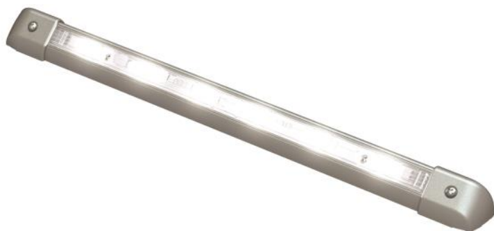
Example of wall mounting