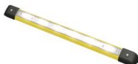
Yellow (RAL 1016) powder coated