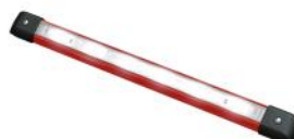
Red (RAL 3000) powder coated

The specifications in the tables are stated for our regular LED light colour 'natural white' (4000K). The light output of the other 2 LED light colours 'cool white' (6000K) and 'warm white' (3000K) may vary slightly. These specifications are available by request.